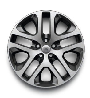
20" STYLE 5095, 5 SPLIT-SPOKE, GLOSS DARK GREY WITH CONTRAST DIAMOND TURNED FINISH