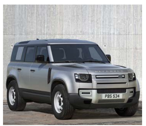
DEFENDER 110 - $89,900