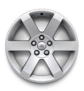
19" STYLE 6009, 6 SPOKE, GLOSS SPARKLE SILVER