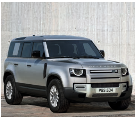
DEFENDER 110 S - $107,900