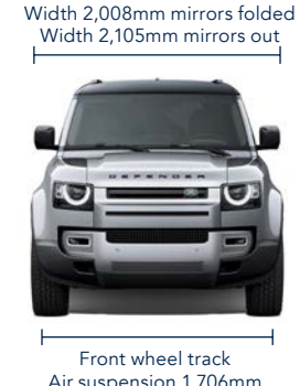
Air suspension 1,706mm Coil suspension 1,704mm

Maximum wading depth Air suspension 900mm Coil suspension 850mm