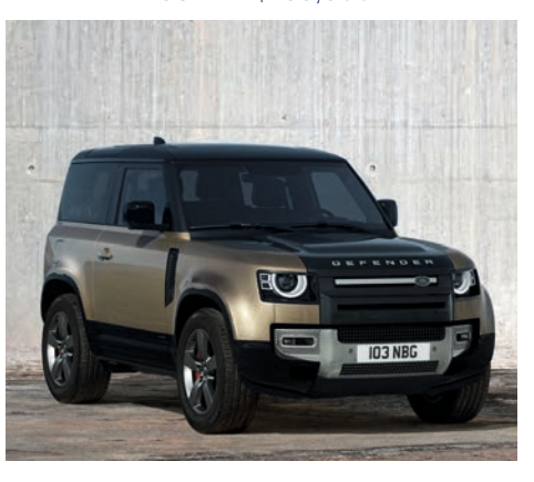
DEFENDER 90 X - $159,900