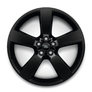
22" STYLE 5098, 5 SPOKE, GLOSS BLACK All-season tyres – Class A