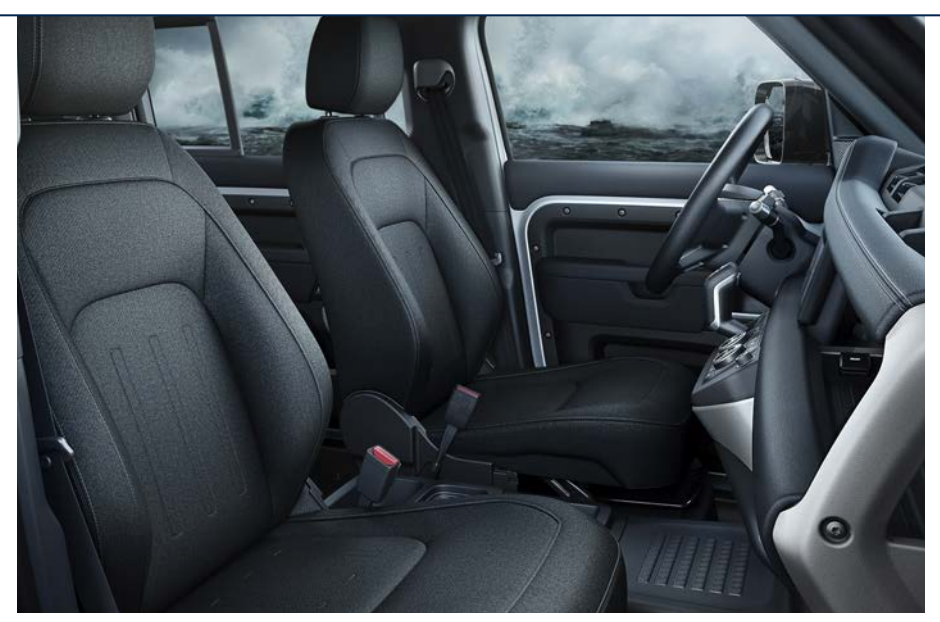
EBONY/EBONY - Interior\ shown\ is\ Ebony\ fabric\ seats\ and\ Ebony\ interior\ with\ cross\ car\ beam\ in\ Light\ Grey\ Powder\ Coat\ Brushed\ finish.