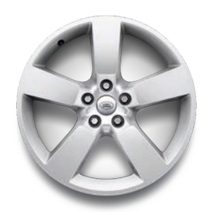
20" STYLE 5098, 5 SPOKE, GLOSS SPARKLE SILVER