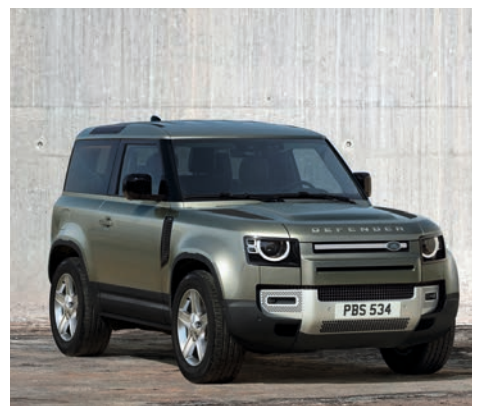
DEFENDER 90 SE - $106,900