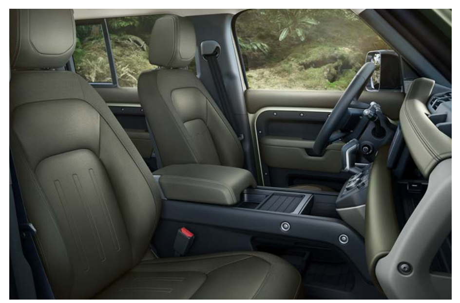
KHAKI/EBONY-Interior\ shown\ is\ Khaki\ grained\ leather\ seat\ facings\ with\ Robust\ Woven\ Textile\ accent\ and\ Ebony\ interior\ with\ cross\ car\ beam\ in\ Light\ Grey\ Powder\ Coat\ Brushed\ finish.