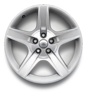
20" STYLE 5094, 5 SPOKE, GLOSS SPARKLE SILVER