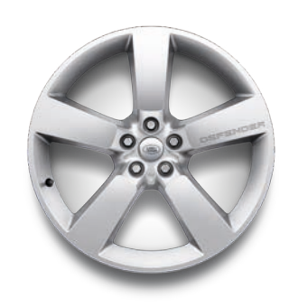
22" STYLE 5098, 5 SPOKE, GLOSS SPARKLE SILVER All-season tyres - Class A