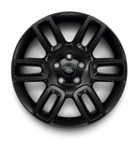
19" STYLE 6010, 6 SPOKE, GLOSS BLACK