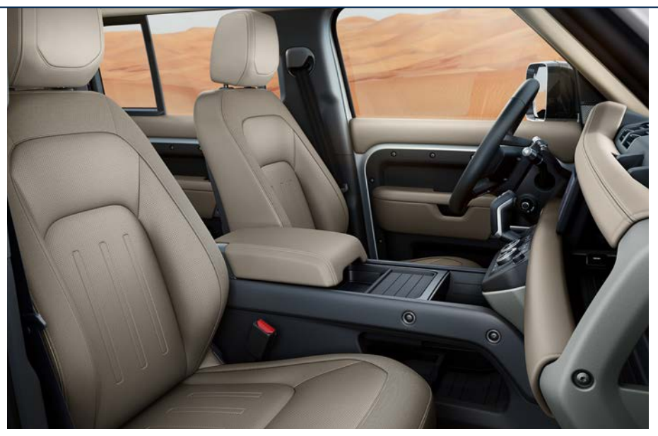
A CORN/LUNAR - Interior\ shown\ is\ Acorn\ grained\ leather\ with\ Robust\ Woven\ Textile\ accent\ and\ Lunar\ interior\ with\ cross\ carbeam\ in\ Light\ Grey\ Powder\ Coat\ Brushed\ finish.