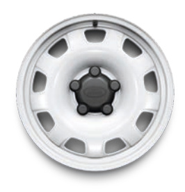
18" STYLE 5093, GLOSS WHITE, STEEL

Configure your Defender at landrover.co.nz