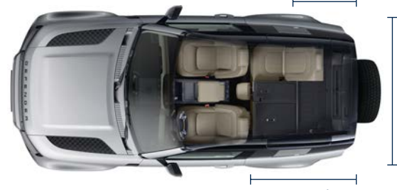
Length behind first row 1,313mm