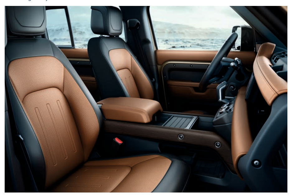
VINTAGE\ TAN/EBONY\ (Defender\ X\ Only)\ -\ Interior\ shown\ is\ Vintage\ Tan/Ebony\ Windsor\ leather\ and\ Steelcut\ premium\ textile\ seats\ and\ Ebony\ interior\ with\ cross\ car\ beam\ in\ Dark\ Grey\ Powder\ Coat\ Brushed\ finish.