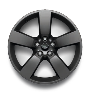
20" STYLE 5098, 5 SPOKE, SATIN DARK GREY