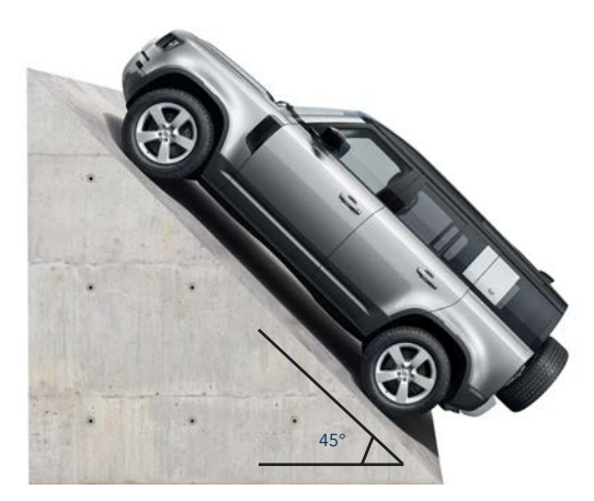
C Departure Angle 40.0° 37.7°