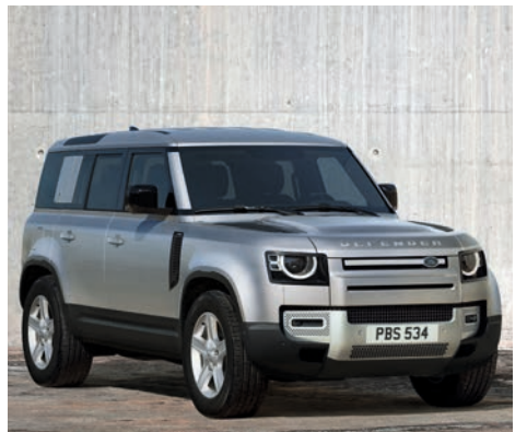
DEFENDER 110 SE - $114,900