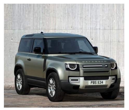
DEFENDER 90 S - $94,900