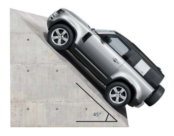
С Departure Angle 40.0° / 35.5° 37.6° / 37.9°