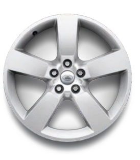
20" STYLE 5098 - 5 SPOKE GLOSS SPARKLE SILVER