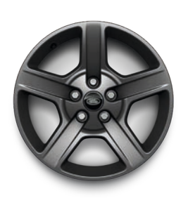
18" STYLE 5094, 5 SPOKE, SATIN DARK GREY