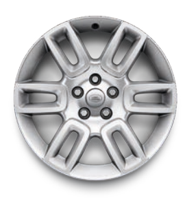
19" STYLE 6010, 6 SPOKE, GLOSS SPARKLE SILVER